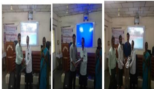
Staff of the Department rewarded by the speaker for their contribution