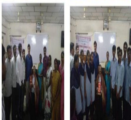
Vice Principal, Staff and students Felicitating the speaker